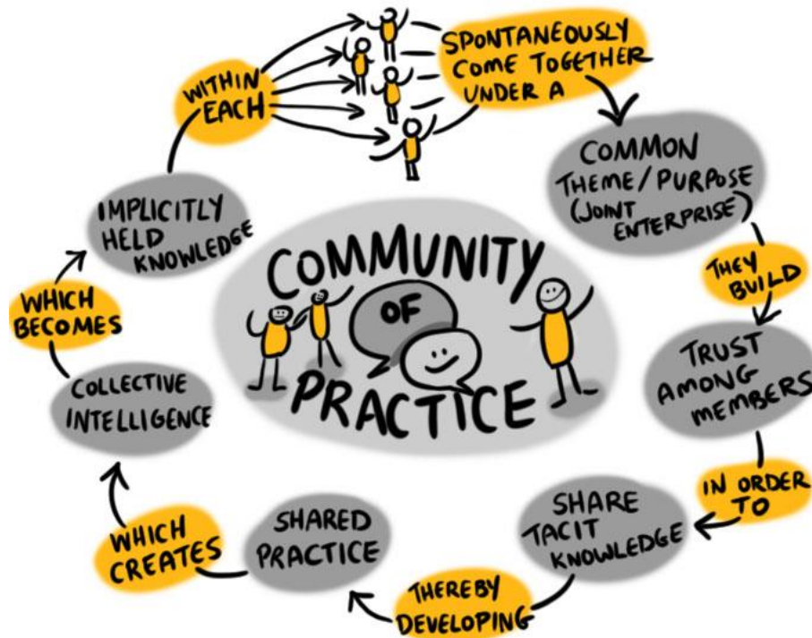
Based on Allan, B. (2008). Knowledge creation within a community of practice

The aim is to broaden your network to include diverse, cross-disciplinary skills and insights, and the online world affords just that. You will find that you can often meet peers and potential collaborators through chance online meetings in discussion groups or by using social networking tools such as Twitter.